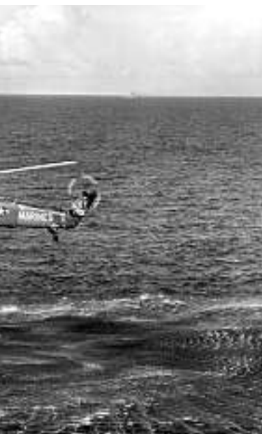
Photo of the failed attempt to recover the Mercury 4 space capsule after Virgil Grissom's 15-minute suborbital flight in July 1961; the capsule, retrieved from the Atlantic in 1999, is on view at the Adler Planetarium

Elmhurst Art Museum 150 Cottage Hill, Elmhurst. "Gardens of Earth and Water," prints and watercolors by Keith Achepohl, through Sun 1/15. ►Tue, Thu & Sat 10-4, Wed 1-8, Fri & Sun 1-4. $4; $3 seniors; $2 students. Closed Sat-Sun 12/24-12/25 & Sat-Sun 12/31-1/1. 630-834-0202