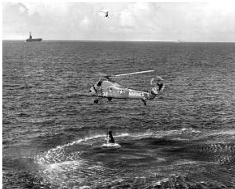
Photo of the failed attempt to recover the Mercury 4 space capsule after Virgil Grissom's 15-minute suborbital flight in July 1961; the capsule, retrieved from the Atlantic in 1999, is on view at the Adler Planetarium

Chicago Children's Museum Navy Pier, 700 E. Grand. Daily 10-5, Thu & Sat till 8. Sat 12/24, 10-2; closed Sun 12/25; Mon 12/26-Fri 12/30, 10-8; Sun 1/1, noon-5. $7; $6 seniors; kids under one free. Thu 5-8 free; first Monday of each month free. 312-527-1000