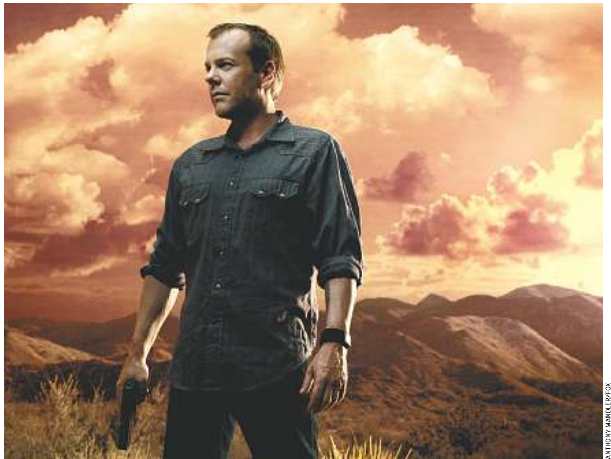
Kiefer Sutherland as Jack Bauer in 24

Vowell should scratch a little deeper: 24 is not your garden-variety unconstitutional fantasy. Jack Bauer is one of the greatest TV characters because he does what needs to be done with deep regard for what the constitution—not to mention his conscience—has to say about his behavior. Unlike, just perhaps, some present leaders of our government, Bauer knows what needs to be done for what it is—evil. He spies and abducts and