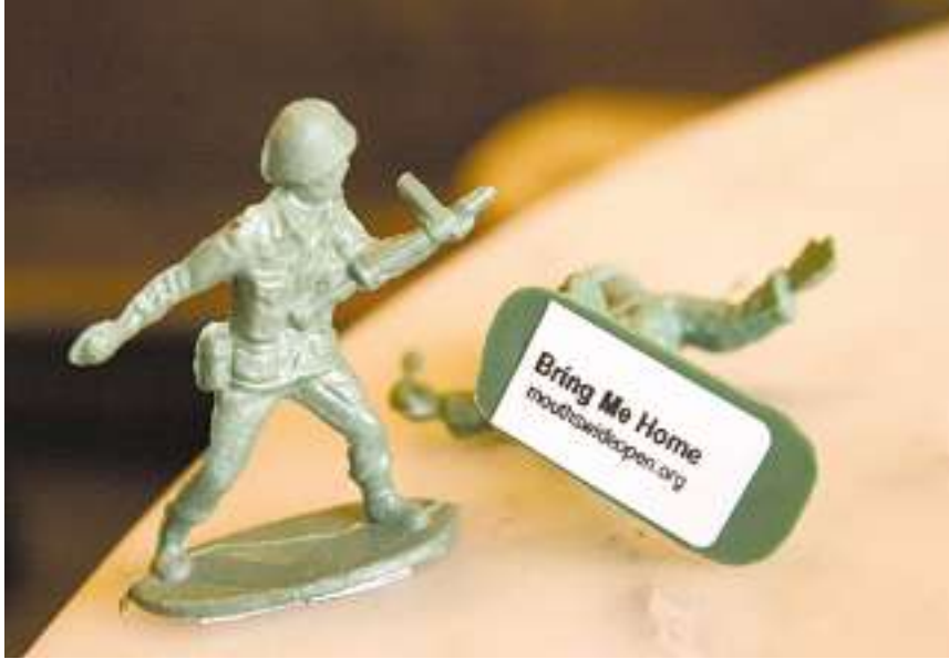
Soldier with a message