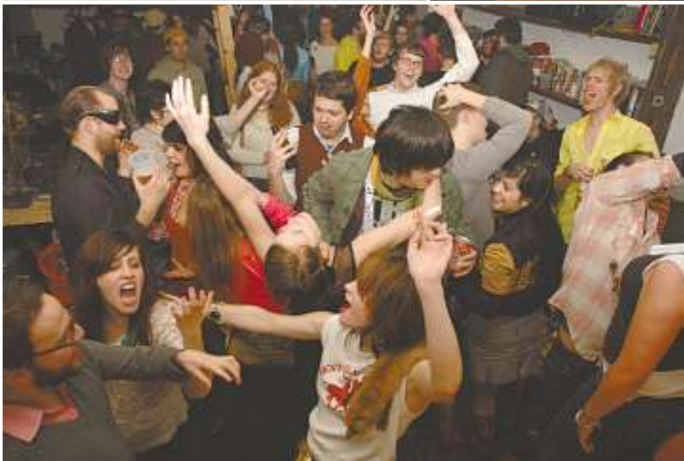
Reader revelers (top left and adjacent); birthday love and . . . treats

director, innocently washing her hands. I'd taken the bait, but I didn't feel that foolish—at one Reader party I actually witnessed illicit substances and near-fornication in the loo. Another year my then-boyfriend tried to get an employee's wife to give him a blow job in a stall. At still another party I came dangerously close to making out in public with a coworker. In fact, there were two years when people told me they weren't bringing dates specifically so they could hook up with colleagues.