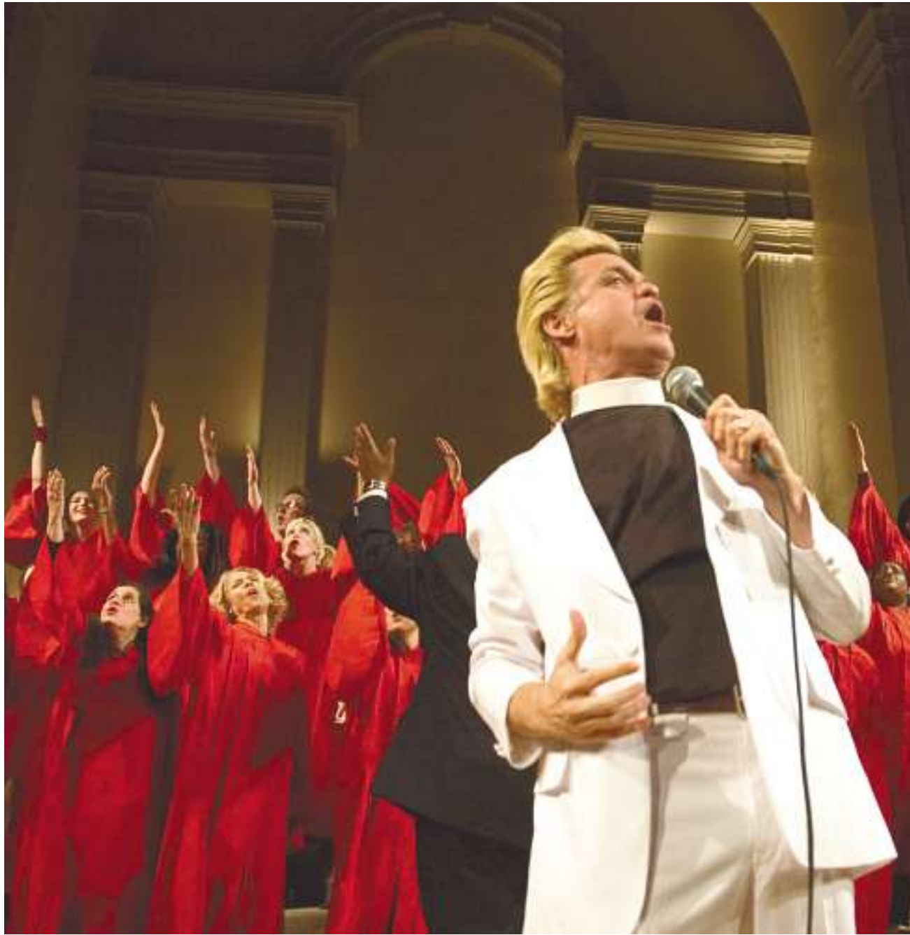
Bill Talen, aka Reverend Billy, at a recent New York appearance

[snip] Are all those people who say they care about the environment lying? Maybe, judging from figures cited by Philip Deutch in Foreign Policy : "More than 50 percent of U.S. consumers now have the option of buying electricity generated from renewable energy sources, but only 1 or 2 percent actually do. Hybrid car sales represent less than 1 percent of automobile sales; suvs account for 25 percent." —HH