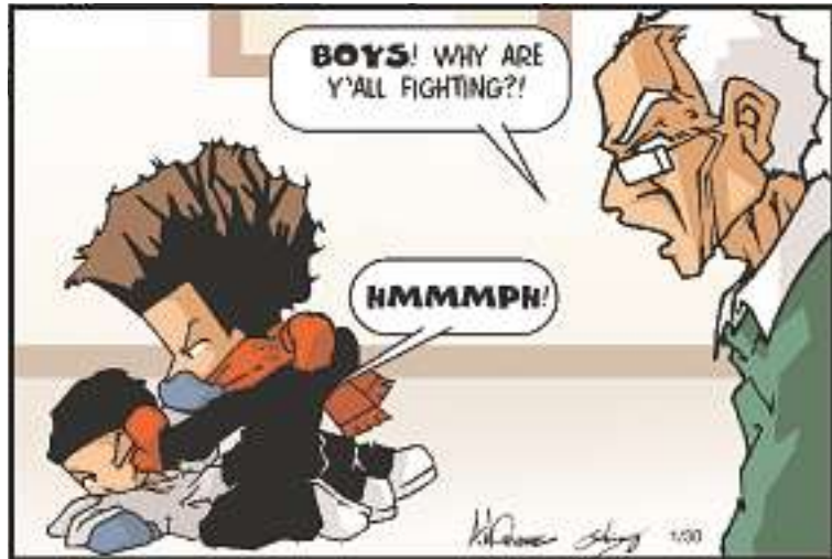
THE BOONDOCKS

The most credible explanation for the strip's arrested development is McGruder's focus on the animated adaptation. The cartoon, which debuts at 10 PM Sunday on Cartoon Network, has