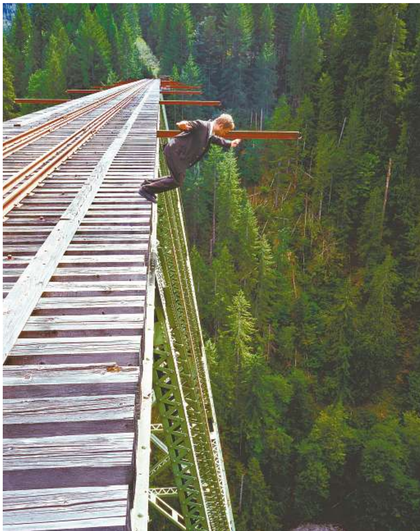
Trestle , from Skarbakka's series "The Struggle to Right Oneself." On Tuesday he'll jump off the roof of the Museum of Contemporary Art.